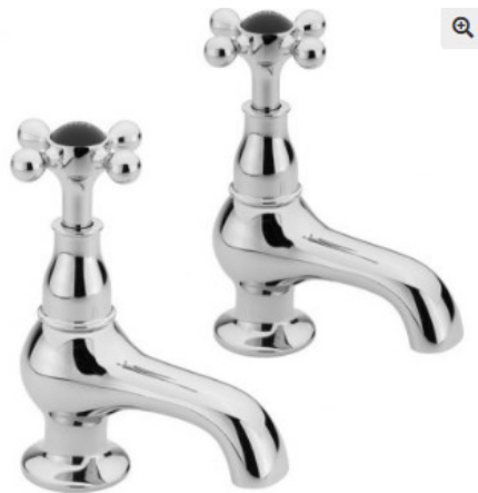
Max Flow Hot Tap